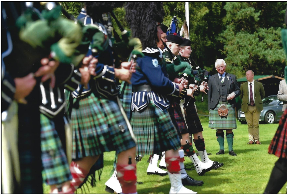
Prince Charles with the Marching Band.