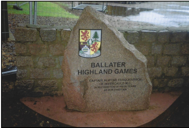
A rock with Ballater Games inscription.