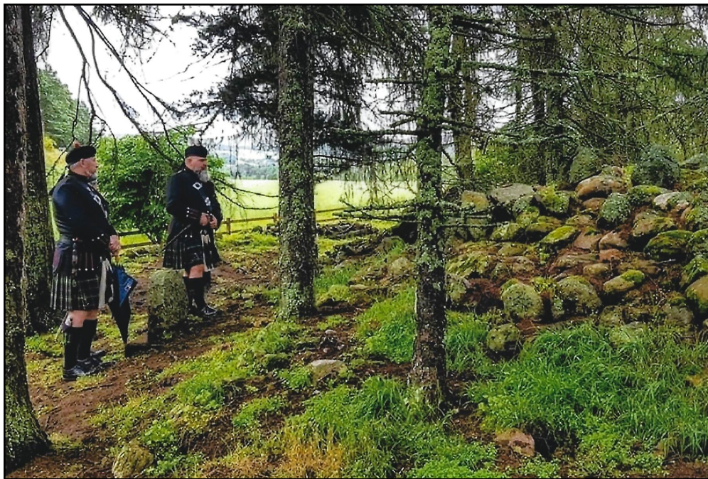
Cairn in trees with two clan members.