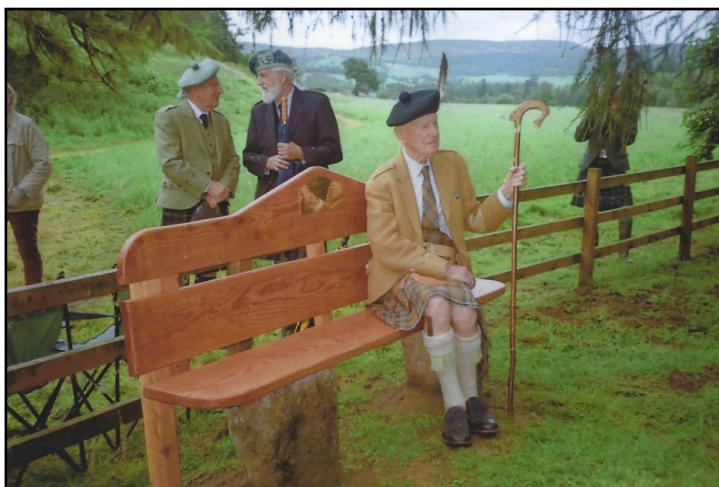
Clan Chief sitting on the bench.

And damp it was the morning we met at Monaltrie Park for the Opening Ceremonies rehearsal. After reviewing the protocol as we practiced on the field, the unfamiliar commands became clear. But when it was revealed that the Prince of Wales would be visiting the Games earlier in the day, I had to ask, "Is this the same Prince of Wales as Prince Charles?" The answer was a curt "yes". My excitement returned.