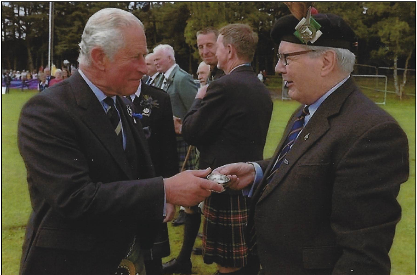
Prince Charles with Clan Farquharson President.